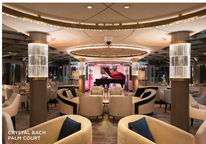
CRYSTAL BACH PALM COURT